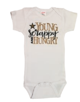
CHILDREN OF THE REVOLUTION

A onesie with the Hamilton refrain "Young, scrappy and hungry" is among the merchandise that fans have created.